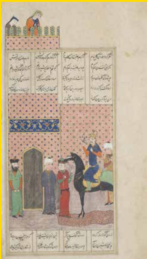
A folio from an illustrated manuscript: A prince arrives at the castle, 15th century AD/ 9th century AH, Timurid Shiraz, Iran.