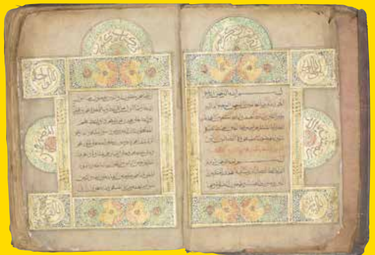
Chinese Qur'an signed by Abdullah Tarbiji al-Sini and copied in the Mosque of Xi'an in 1003 AH, 19th century AD/ 13th century AH, China.