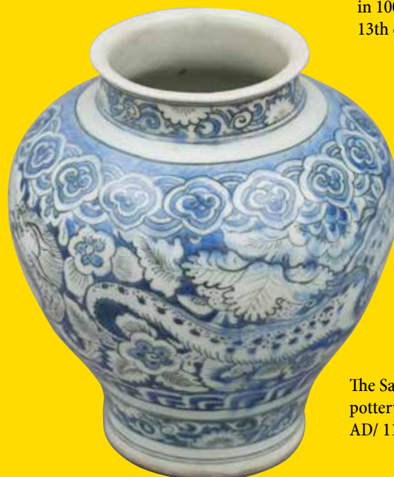
The Safavid blue and white pottery jar, 17th century AD/ 11th century AH, Iran.